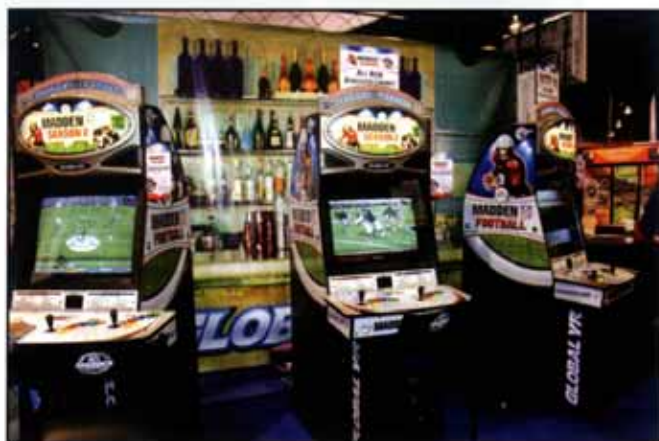
The release of Madden 2 headlined Global VR's AMOA Expo exhibit.

Game Maker Global VR is Embarking on its Second Act as a Top Coin-op Factory