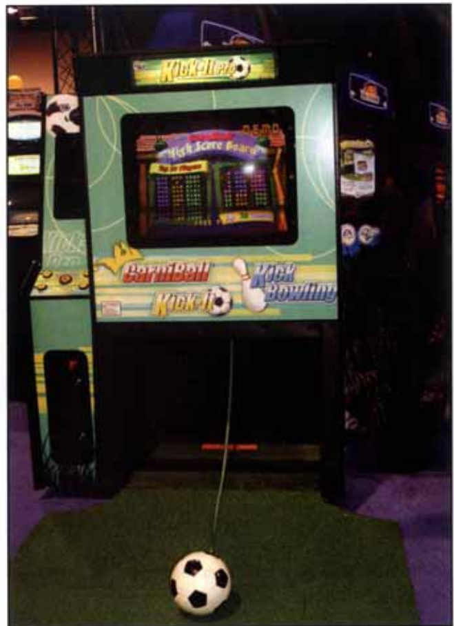
Global VR has put a new face on their popular Kick It Pro soccer sim.